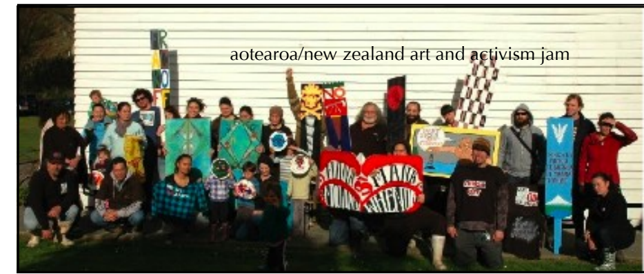
aotearoa/new zealand art and activism jam

August 19-21, 2011, Aotearoa (New Zealand) – The wananga (gathering) focused on common goals and initiatives which support art practice and reinforce grassroots activism. It was a unique mixture of 50+ kaumatua (elders), rangatahi (young people), maatua (parents) and tamariki (children) from activist and visual artist communities. Participants co-created art and music about who we are, what drives our art or activism, and its connection to Papatuanuku (Earthmother), particularly to issues of drilling and mining on the sea bed and foreshore.