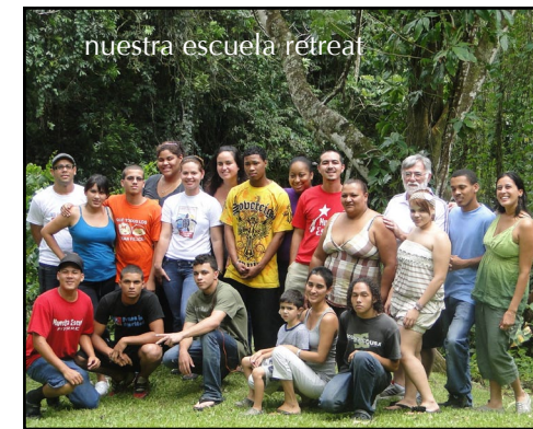
nuestra escuela retreat

May 13-18, 2011, Caguas, Puerto Rico - Literally translated as “Our School”, Nuestra Escuela is founded on a mission of love, respect and the belief in the potential and power of young people. Youth who have been labeled 'at-risk', 'delinquents', 'failures' in other contexts are met with peer leaders, mentoring faculty, and accessible administrators, who support them to (re)discover their passions and capacities, to develop the skills and leadership they need, in order to actualize a purpose in their lives. YES! offered tools and processes to further their powerful mission and strengthen their amazing community.