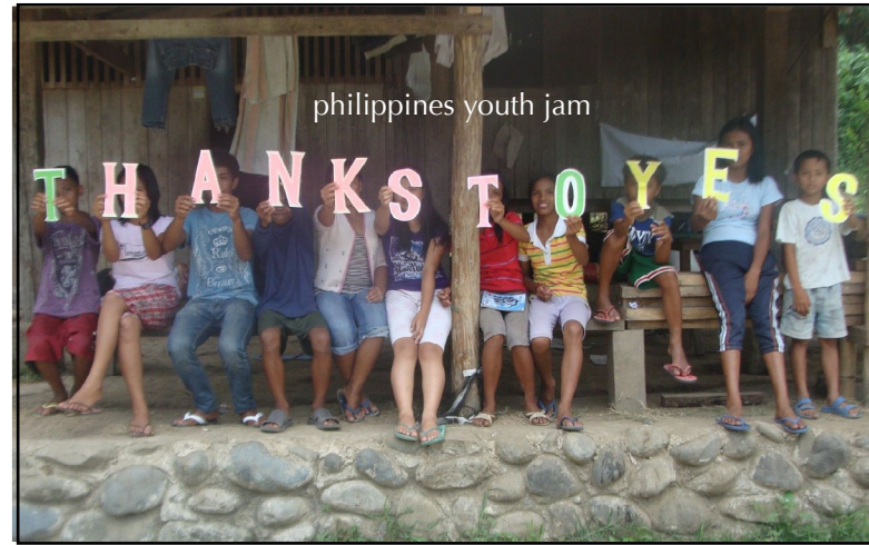
philippines youth jam