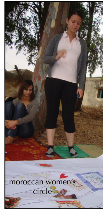
moroccan women's circle