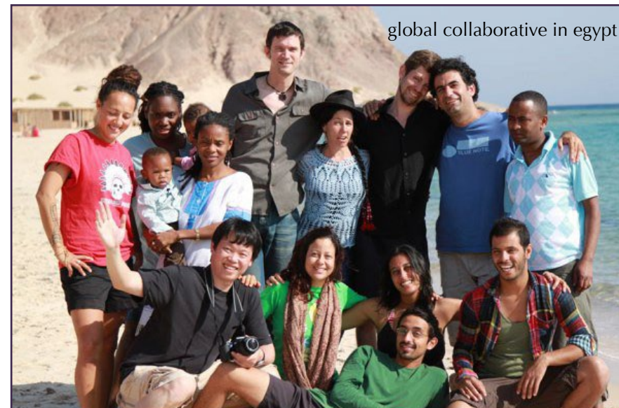
global collaborative in egypt

ongoing, various locations around the world - Now in its sixth year, the GC project is an effort to strengthen a global network of young leaders, by offering personal, professional, interpersonal and cultural development, particularly through Jams and Jam-like ‘transformational leadership’ spaces and networks. There are 15 members from 14 different countries, eight women and seven men. We have five primary areas of activity: convening an annual gathering; activating a flow fund program; administering travel scholarships for regional gatherings; developing documentation and communication vehicles; and infrastructure and governance. The GC continues to be filled with dynamic connections, and the sharing of our work has increased in breadth and depth.